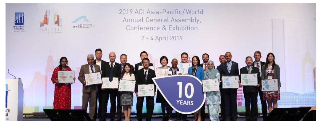
Asia-Pacific Airports celebrated their Airport Carbon Accreditation achievements at the 2019 WAGA Special Ceremony.

2019 marks the 10<sup>th</sup> anniversary of the Airport Carbon Accreditation programme. ACI took the opportunity to provide an update to conference delegates on the milestones achieved over the last 10 years. Globally, 264 airports are accredited under the programme. <u>18 of the 54 accredited airports</u> in Asia-Pacific region were also celebrated and presented with certificates: 8 airports at Level 1 'Mapping', 5 airports at Level 2 'Reduction' and 5 airports at Level 3 'Optimisation', the highest level possible without using carbon offsets.